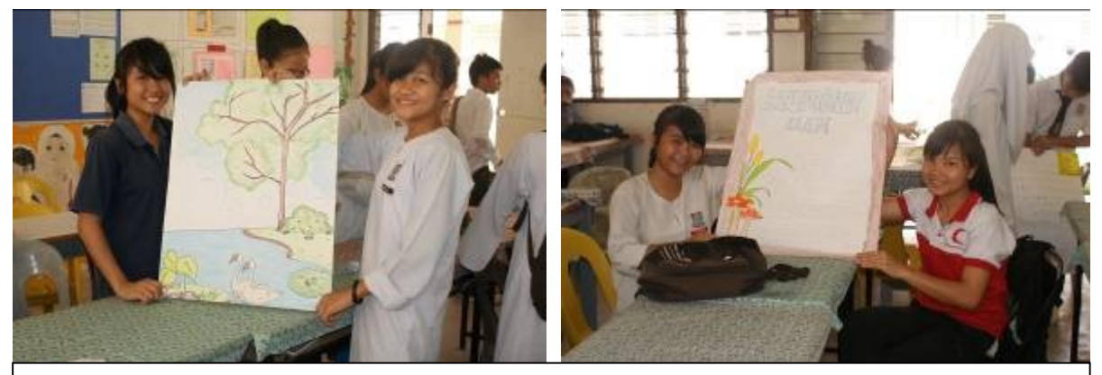
Pelajar menyampaikan mesej alam sekitar melalui poster