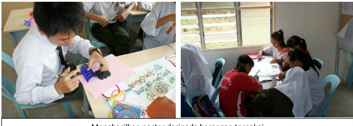
Menghasilkan poster daripada barangan terpakai